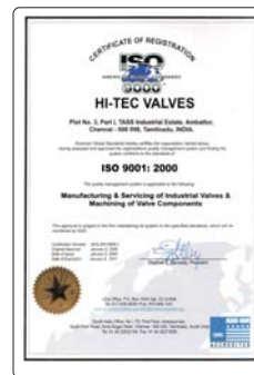
ISO 9001:2000 Certificate

HI-TEC VALVES IS COMMITTED TO ENHANCE CUSTOMER SATISFACTION THROUGH PRODUCTS STANDARDS FOR MANUFACTURING, SERVICING OF INDUSTRIAL VALVES AND MACHINING OF COMPONENTS THROUGH QUALITY, TIMELY DELIVERY AND RELIABILITY WITH CONTINUAL IMPROVEMENT.